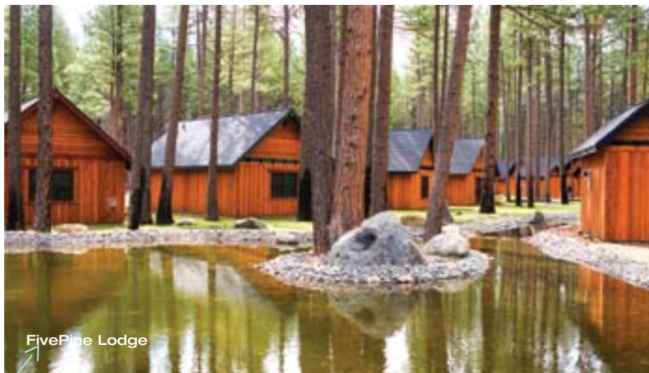
○ FivePine Lodge 1021 Desperado Trail, 866-974-5900, fivepinelodge.com

Sisters, Oregon is a quaint mountain town located in the foothills of the Three Sisters Mountains. With close proximity to restaurants and town amenities as well as rivers and mountains, FivePine Lodge is an ideal romantic getaway in the Cascades. Roughly three hours from Portland, this lodge features everything necessary for a true resort destination with a fine dining restaurant, movie house, brewpub and spa, all on-site.